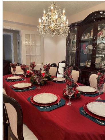
This is a photo of the table before we sat down to eat.

We look forward to sharing more stories when we get together again on Tuesday, January 10 at 1 pm. We will continue our study on “Loving Like Jesus.”