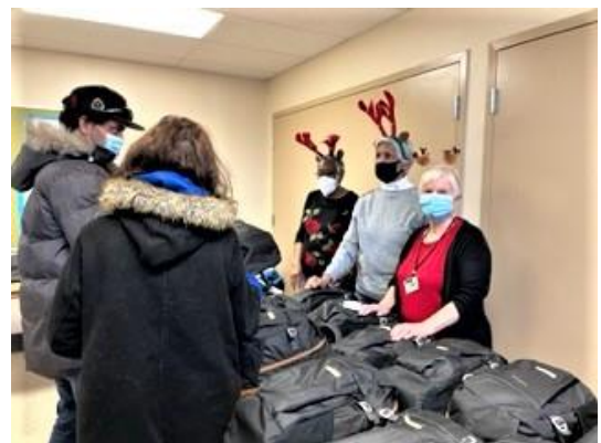
Volunteers hand out backpacks